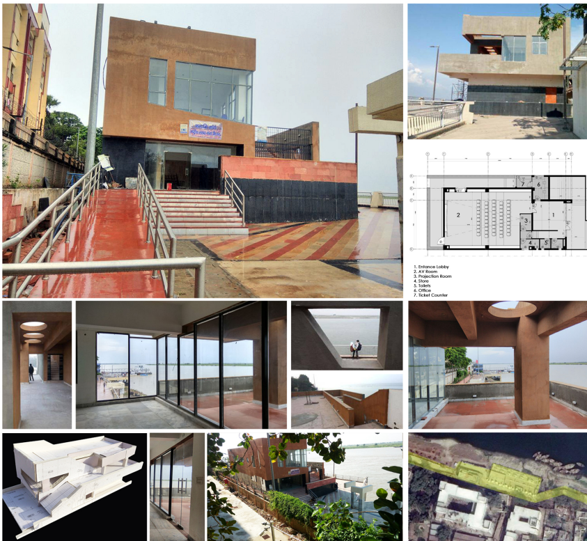
Figure 2. Umbrellas by the River_ Public Space Intervention